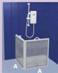
Ideal for rooms with restricted space. Not handed