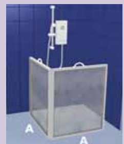
Taller screen height to keep the carer drier. Not handed