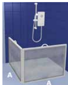
Wider screens are ideal for use with a mobile shower chair. Not handed