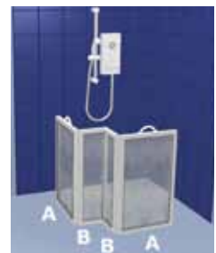
By incorporating more panels the screen can be closer to the user. Not handed