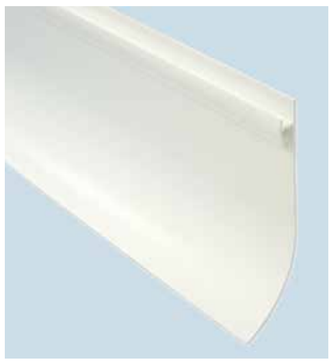
Supplied in 2 metre lengths. Can be cut on site to suit.