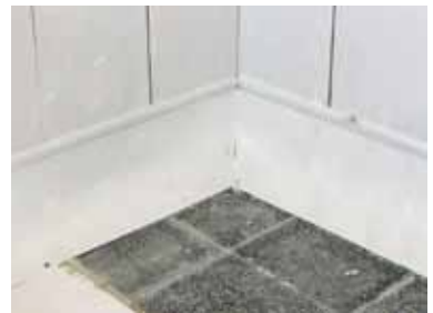
With the covings in place, now tile your walls. Use silicone sealant to form a seal between Contour coving and the tiles