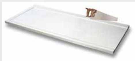
Cut to length