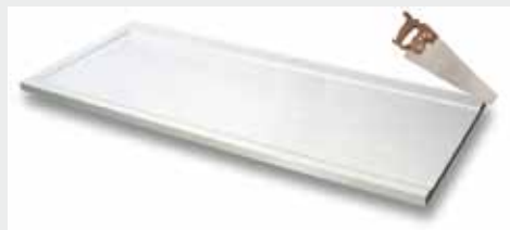
Cut to width