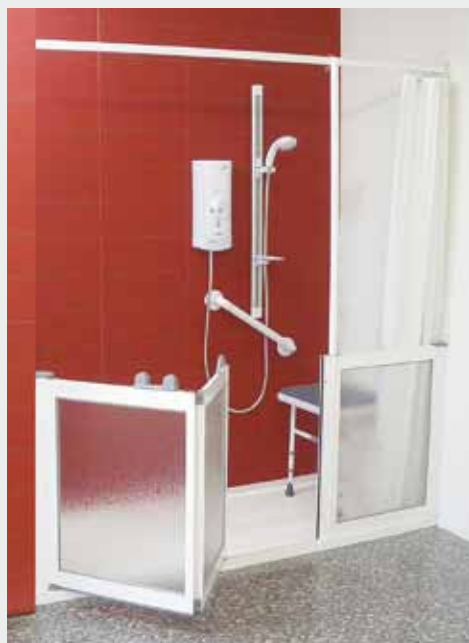
Penguin B RH illustrated See below for more options