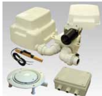
Primo pump with Pump Kit 'C'. CSG1 should be used when creating a traditional screened wet floor area. Reference 05PP01C