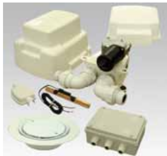
Primo pump with Pump Kit 'B'. USG1-WH should be used with a floor former. Reference 05PP01B