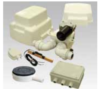
Primo pump with Pump Kit 'D'. UPSW-4 should be used with our Prinia step in tray or a tray with a 90mm diameter waste hole. Reference 05PP01D

Primo conforms to the requirements of the EC Low Voltage Directive 73/23/EEC (amended by 93/68/EEC)