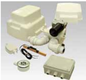
Primo pump with Pump Kit 'A'. UPSW-3-22 should be used with a level access or conventional above ground tray. Reference 05PP01A

PRIMO CAN BE DIRECTLY LINKED TO A MIRA ADVANCE ATL FLEX EXTRA, ELIMINATING THE NEED FOR A FLOWSWITCH