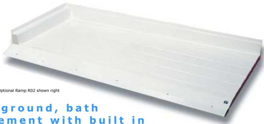
Optional Ramp R02 shown right