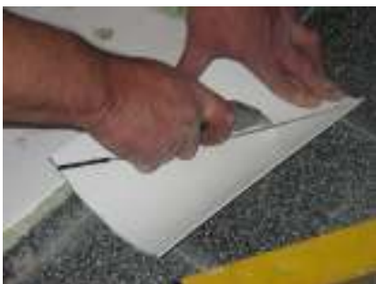
Using the cut-out section, cut diagonally from the bottom edge of the coving cut-out to approximately 20mm below the top corner