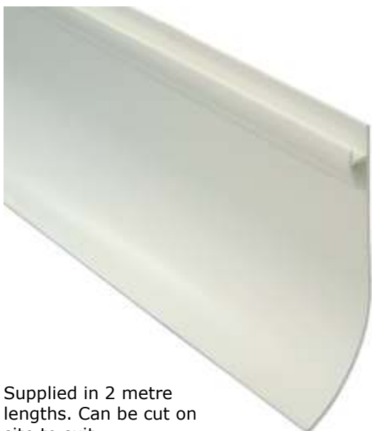
Supplied in 2 metre lengths. Can be cut on site to suit.