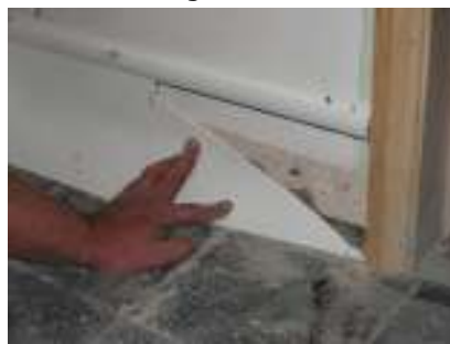
The cut-out section should taper towards the door architrave