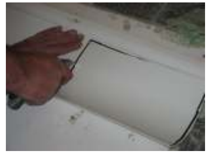
Measure back approximately 300mm from the architrave towards the corner and mark and cut out a rectangle