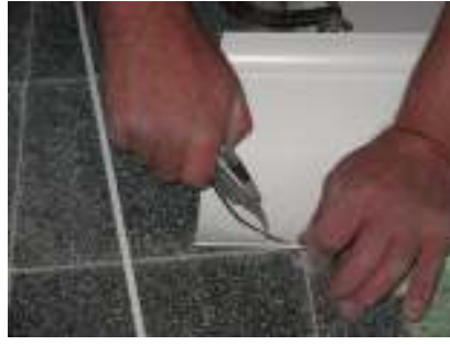
Carefully cut away the outer extremity of the coving so that it will butt up tight in the corner