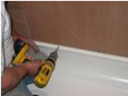
Screw the profile to the wall through the tiling lip