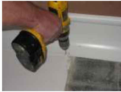
Pilot drill and screw to the floor former