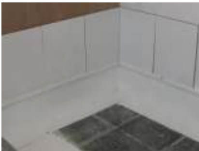
Now tile your walls. Use silicone sealant to form a seal between Contour coving and the tiles