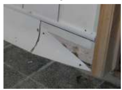
Secure the bottom edge of your cut-out to floor. You should now have a tapered profile finishing at the door