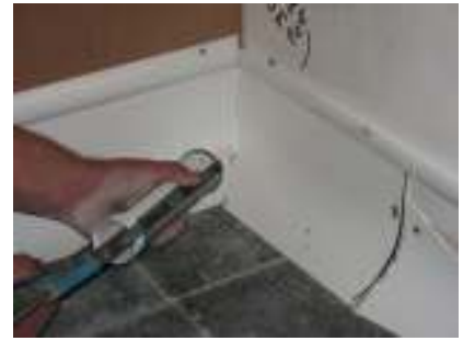
Use silicone sealant at the corner joint to form a seal between the coving sections