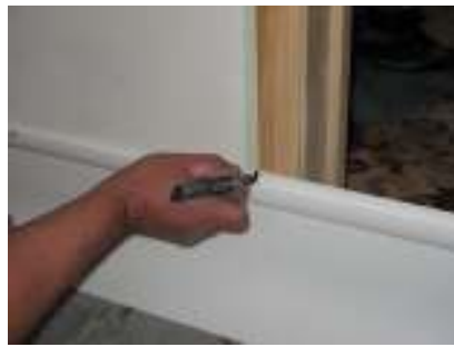
Contour Coving can be easily modified to finish at a door architrave. Mark the size required and cut to length