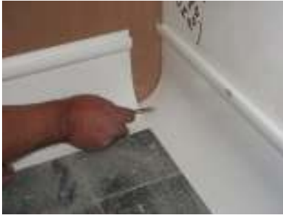
Using one coving profile as a guide, make a mark for the corner joint