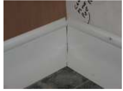
Both coving profiles should come together with a neatly cut edge