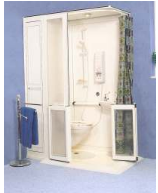
Cormorant C with WC LH illustrated