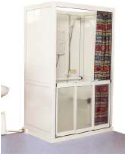
Dove B RH illustrated