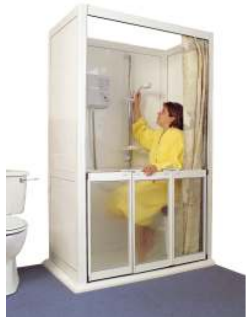
Mallard Option C RH illustrated