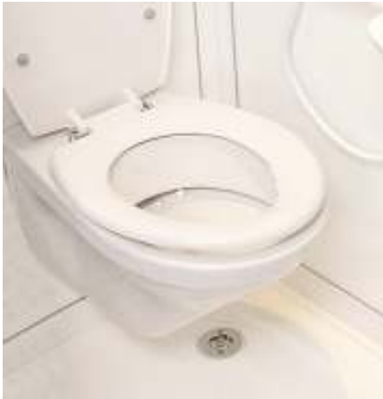
Wall hung WC (seat not supplied as standard, see page 107)