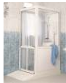
Linnet C LH