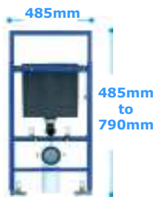
Adjustable WC frame