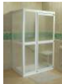
Kestrel E RH

Full height enclosures provide more privacy when used within the bathroom and by other members of the family, or half glazed cubicles when assisted bathing is required.