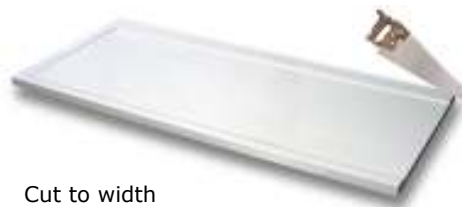
Cut to width

The Penguin is designed so that it can be adapted by width and length. The tray can be cut to width from a maximum of 800mm to a minimum of 710mm. Can be cut to length by as much as 500mm from 1800mm down to 1300mm to fit exactly in the space left by a bath.