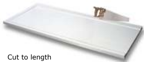
Cut to length