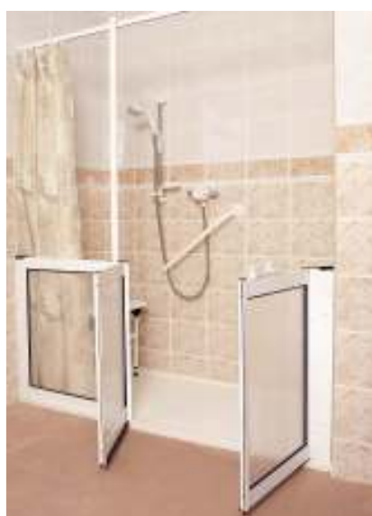
Penguin A LH illustrated See below for more options