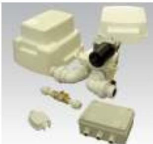
Primo pump consisting of pump, control box, flowswitch & housing. Reference 05PP01

PRIMO CAN BE DIRECTLY LINKED TO A MIRA ADVANCE ATL FLEX EXTRA OR SELECTRONIC WP PLUS, ELIMINATING THE NEED FOR A FLOWSWITCH