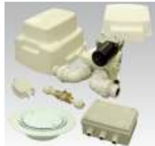
Primo pump with Pump Kit 'B'. USG1-WH should be used with a floor former. Reference 05PP01B