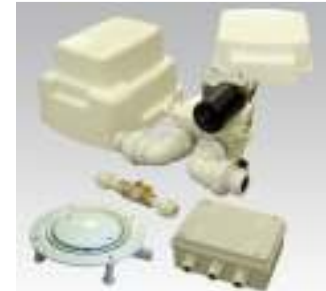
Primo pump with Pump Kit 'C'. CSG1 should be used when creating a traditional screeded wet floor area. Reference 05PP01C

Primo conforms to the requirements of the EC Low Voltage Directive 73/23/EEC (amended by 93/68/EEC)