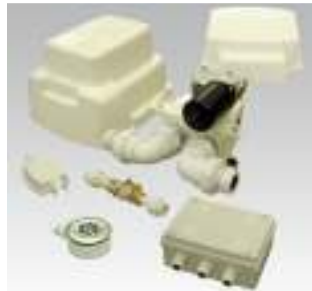
Primo pump with Pump Kit 'A'. UPSW-3-22 should be used with a level access or conventional above ground tray. Reference 05PP01A