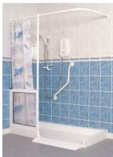
Puffin Y LH illustrated, with optional Ramp R01, See below for more options

The use of an optional ramp will allow for wheelchair access. See page 104 for more details.