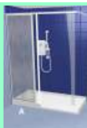
A – 550

Full height fixed panel at 1850mm and vertical support pole. Left hand illustrated PUFFLHXLH PUFFRHXRH