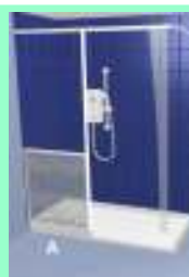
A – 660

Half height fixed panel for assisted bathing and vertical support pole. Left hand illustrated PUFFLHYLH PUFFRHRYH