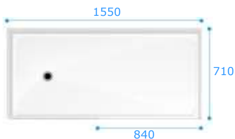
Left hand illustrated Reference Code: PUFFLH PUFFRH