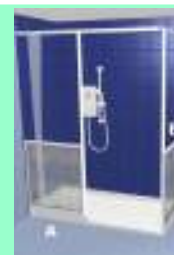
A – 660 B – 700

Half height fixed side and return panel for assisted bathing, with a vertical support pole. Left hand illustrated PUFFLHZLH PUFFRHZRH