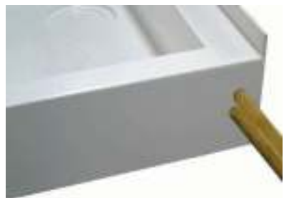
Built in pipe duct