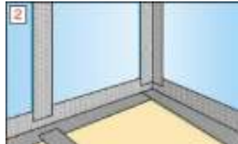
2 Apply Tilesafe reinforcing tape to all wall to wall as well as wall to floor junctions. Reinforcement tape is also required at all Tilesafe membrane butt joints.