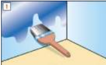
1 Prime all surfaces with Tilesafe primer and allow to dry (20mins)

Tilesafe kit comprises all components necessary to provide the ideal waterproofing solution. Includes, primer, reinforcing tape, membrane, jointing compound and putty.