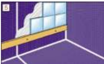
5 Remove the special Tilesafe membrane release film and begin tiling.