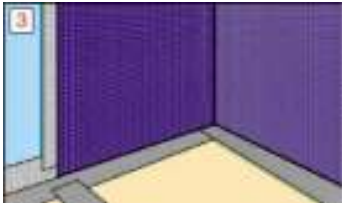
3 Apply the self adhesive Tilesafe membrane to walls and floor. Joints are simply butted with 1-2mm gap over previously applied reinforcement tape