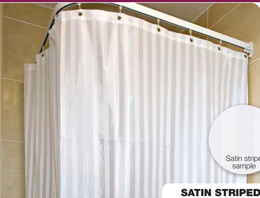
Satin stripe sample