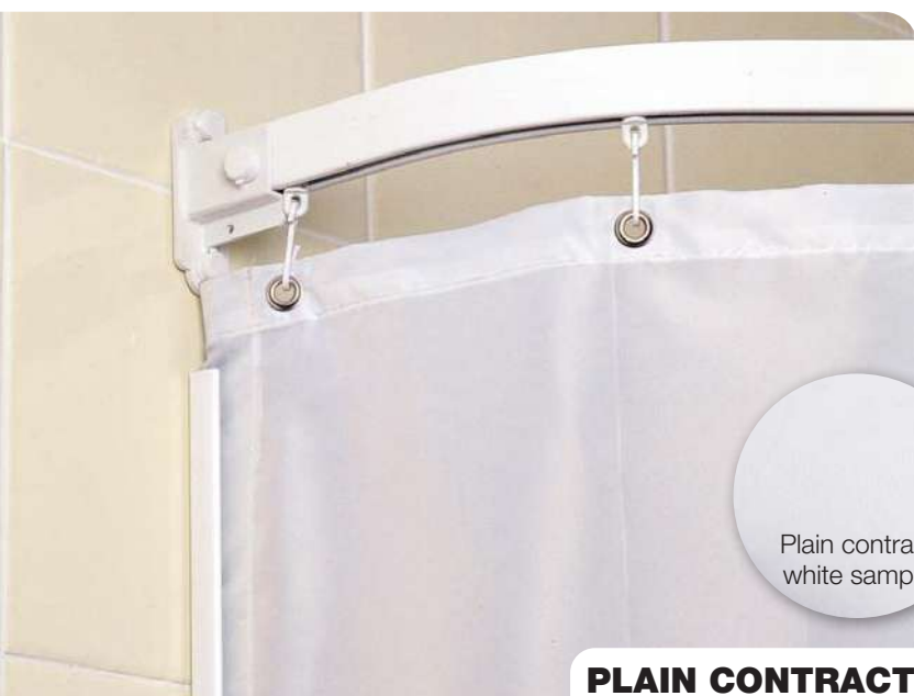
Plain contract white sample