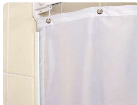
Captive curtain profile eliminates leaks between the wall &amp; shower curtain.

PLEASE NOTE: Curtain sizes are approximate as there may be some slight size variation during the manufacture process.