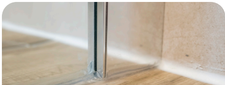
Square profile for tiled floors. Please state when ordering if for tiled or vinyl safety flooring.