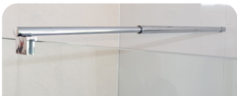
Unique telescopic tie bar. Adjusts between 700 - 1200mm.