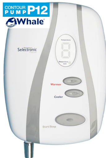
REDRING SELECTRONIC PREMIER PLUS 8.5 & 9.5 kW