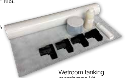
Wetroom tanking membrane kit